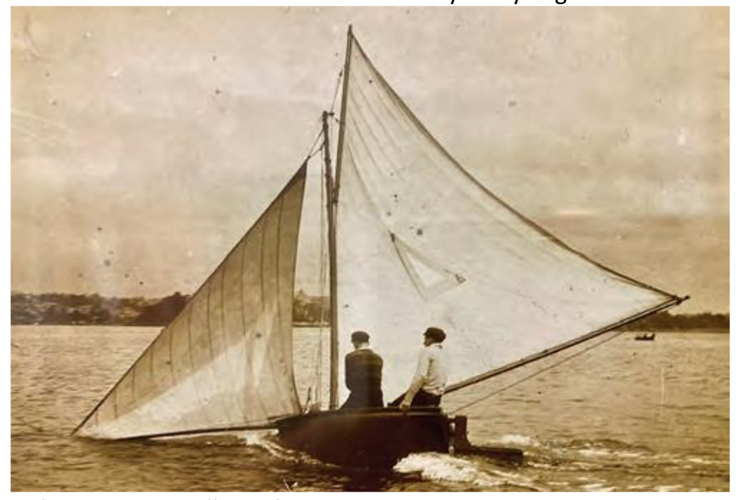
Keddie first mastered the difficult 6-foot class.