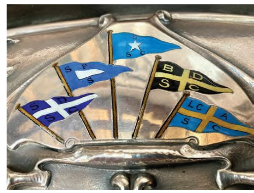
Burgees of all the contributing skiff clubs were enamelled onto the shield.

Just one of them – the Flying Squadron – survives today, but before the Great War there were more than a dozen of these vibrant open-boat sailing clubs clustered around the Sydney Harbour waterfront. Before the advent of radio and television, sport was the primary form of mass entertainment in Australia.