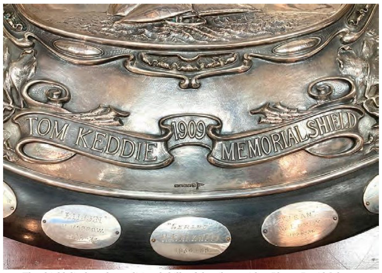
The shield displays the traditional skills of the silversmiths.